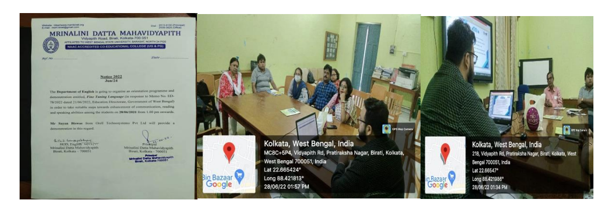
An Orientation Programme and Demonstration entitled, Fine Tuning Language