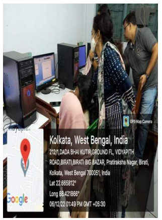
Two-Day Workshop, ICT Computing Skills, organized by the Departments of English and Computer Science on 06/12/2022 and 07/12/2022