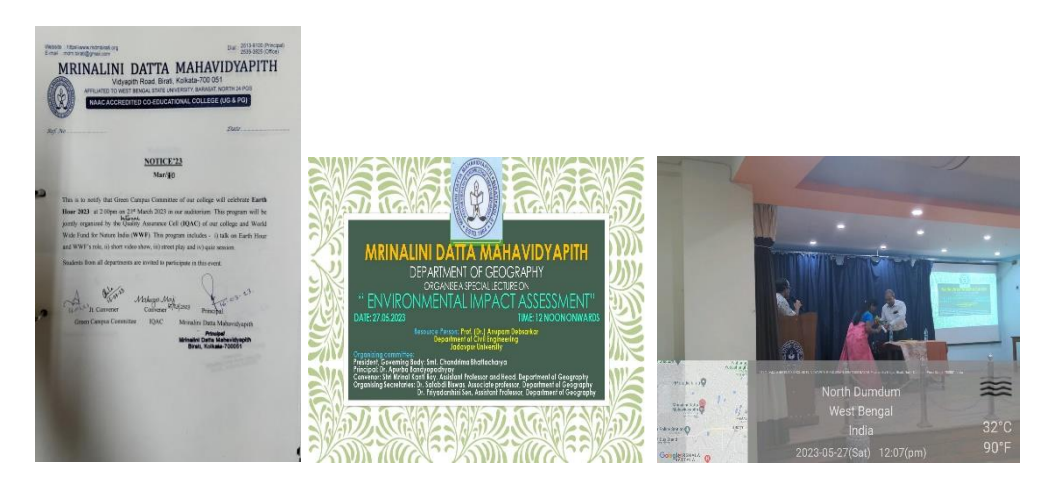
Earth Hour 2023 celebrated by Green Campus Subcommittee jointly organized by the IQAC and World Wide Fund for Nature India (WWF) on 21/03/2023